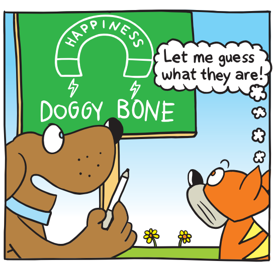
"I'm trying to make a word magnet for happiness, but I can only think of two words."